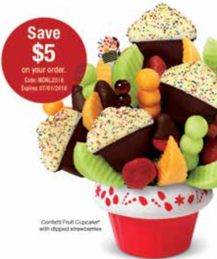
Contest's Fruit Cupcake® with dipped strawberries

243 State Street / New London, CT 860-437-3166